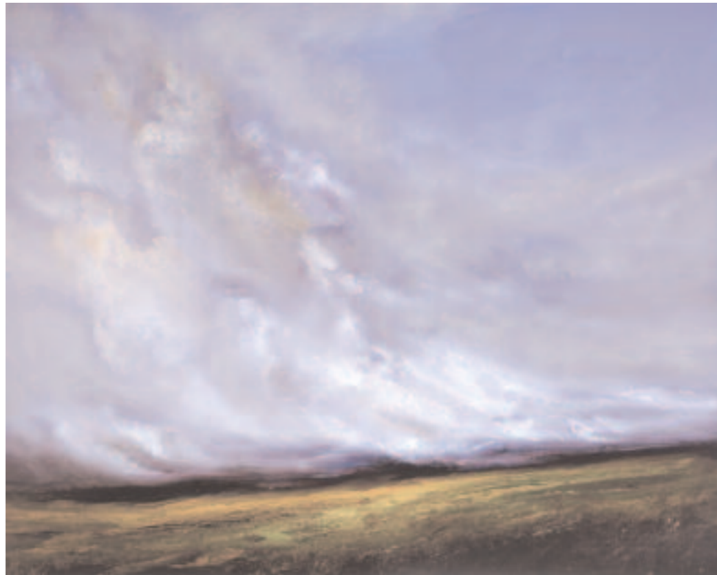
Summer Light (Argyllshire) , 2006, oil on canvas, 4 x 5 ft (122 x 152 cm)