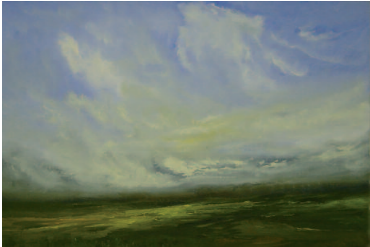
Summer Skies (Rannoch Moor) , 2006, oil on linen, 4 x 6 ft (122 x 183 cm)