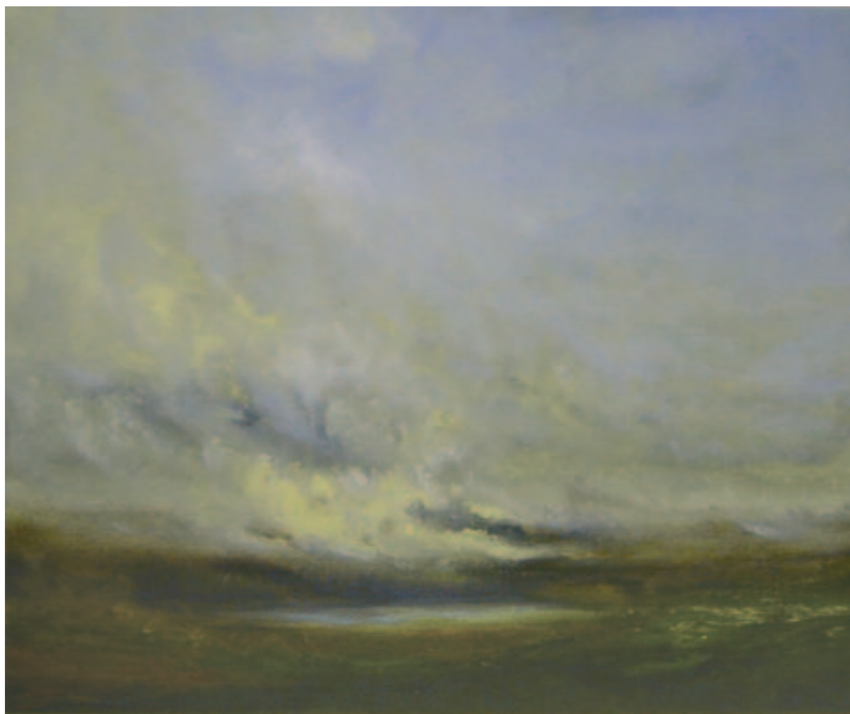
Evening Loch (Argyllshire) , 2006, oil on linen, 5 x 6 ft (152 x 183 cm)

Bonnie Scotland I adore thee, Now I wander gladly o'er thee, Thy enchantment will restore me, Bonnie, bonnie Scotland.