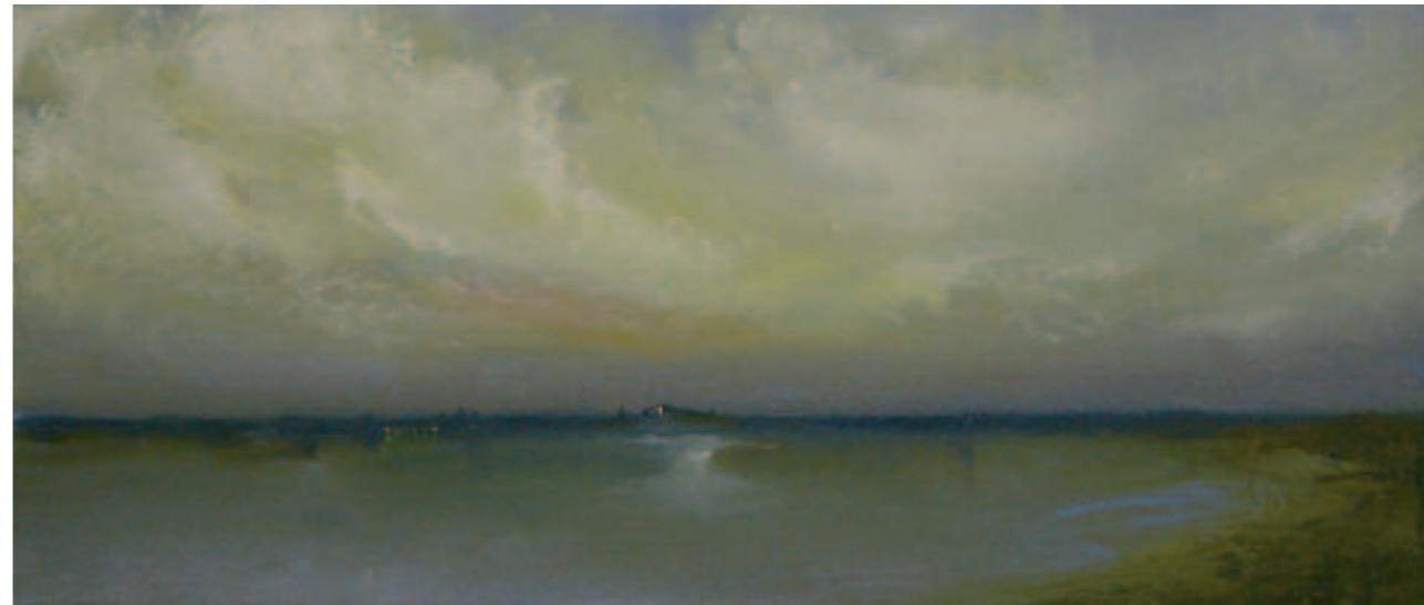
River Lights (Thames) 2 , 2005, oil on canvas, 16 x 38 in (41 x 71 cm)