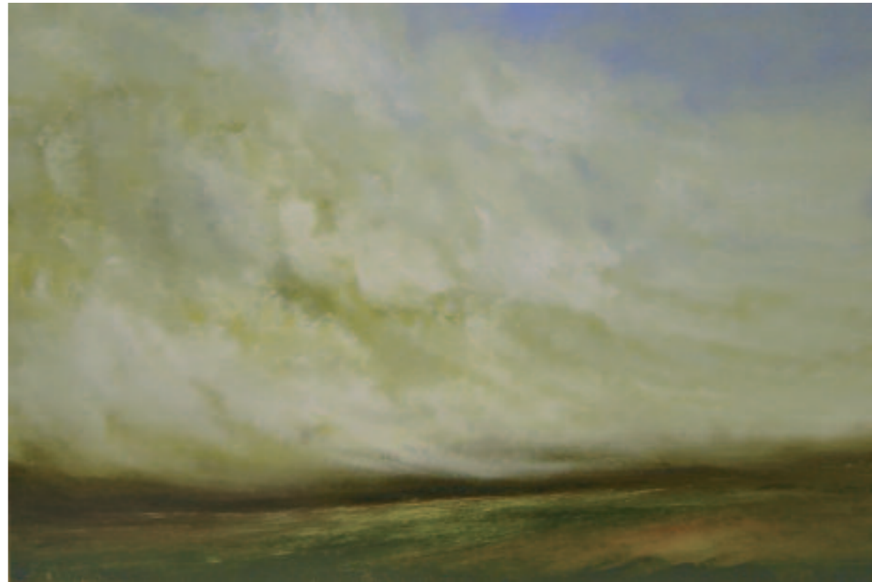
Late Afternoon Light on Rannoch Moor , 2006, oil on linen, 4 x 6 ft (122 x 183 cm)