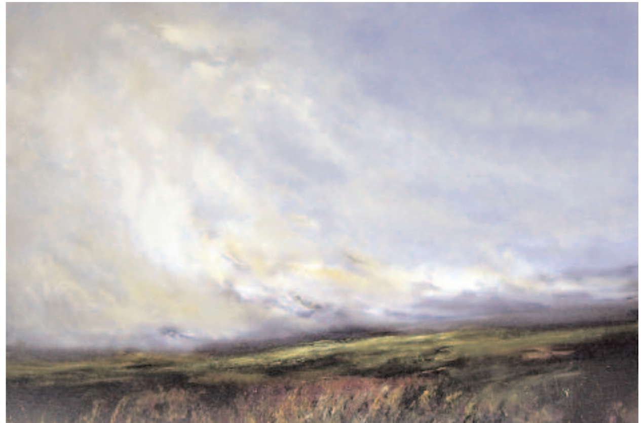
Summer (Argyllshire) , 2006, oil on linen, 4 x 6 ft (122 x 183 cm)