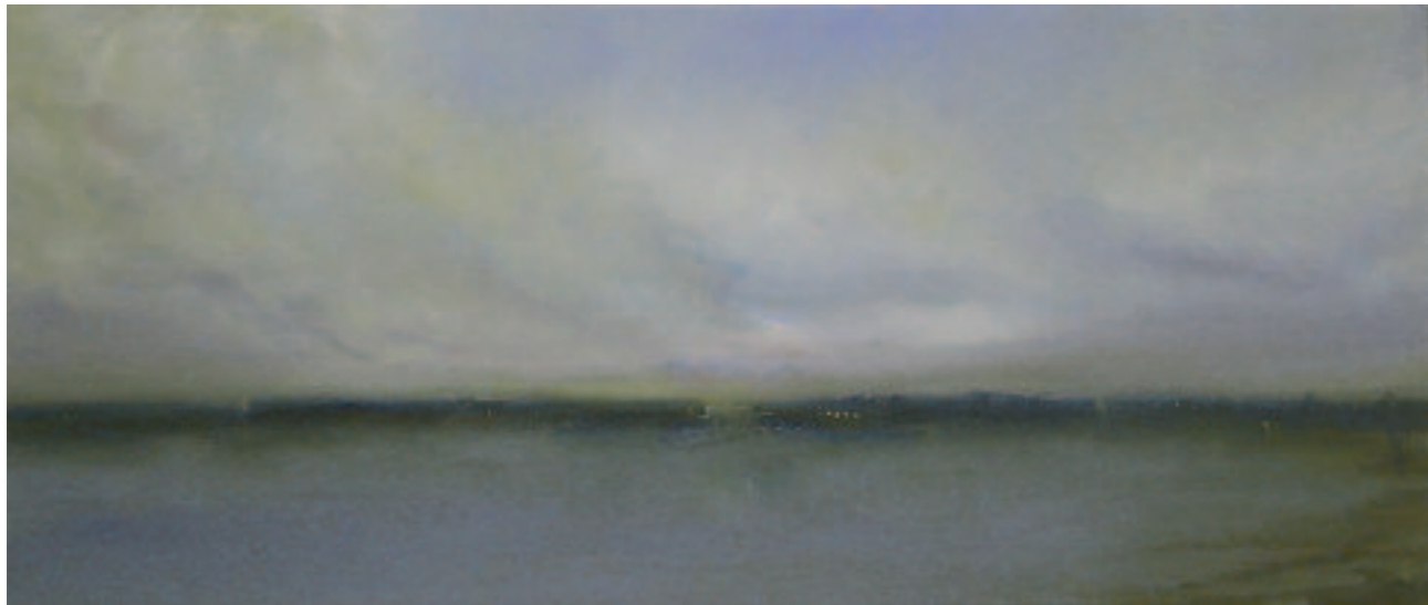
River Lights (Thames) 1 , 2005, oil on canvas, 16 x 38 in (41 x 71 cm)