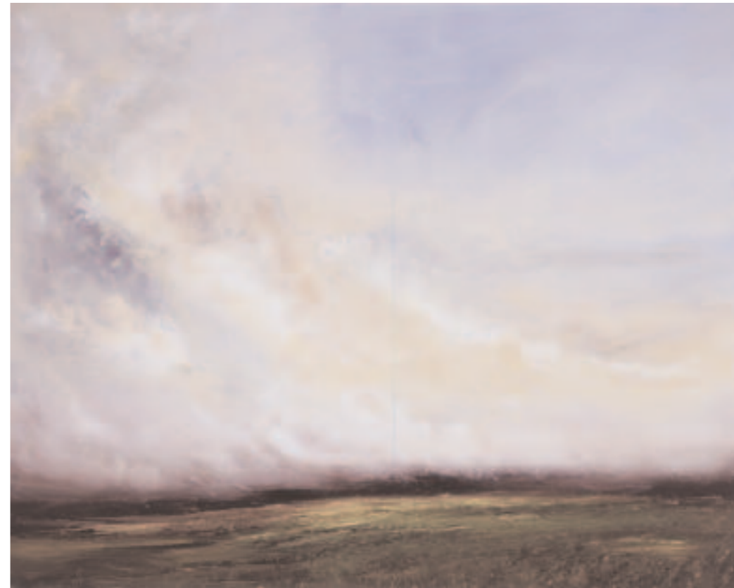
Summer Evening (Argyllshire) , 2006, oil on canvas, 4 x 5 ft (122 x 152 cm)