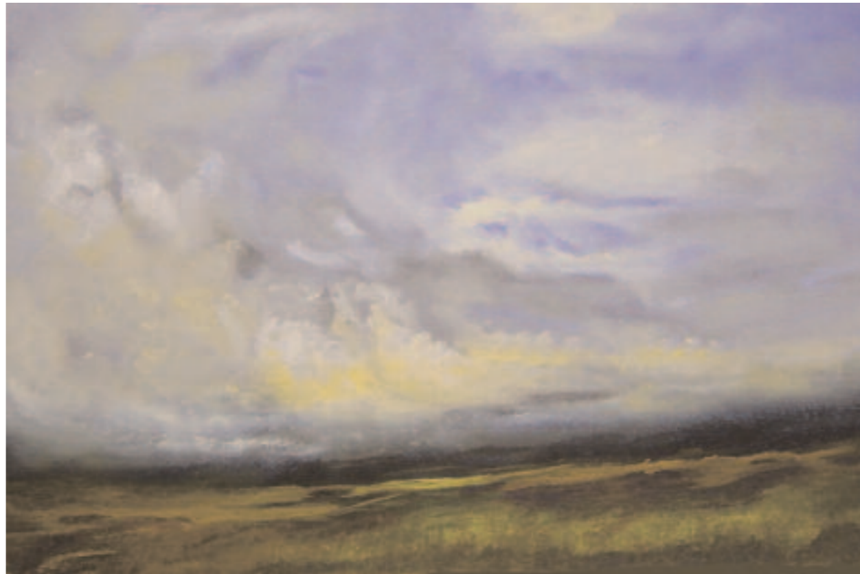
Clouds (Rannoch Moor) , 2006, oil on linen, 4 x 6 ft (122 x 183 cm)