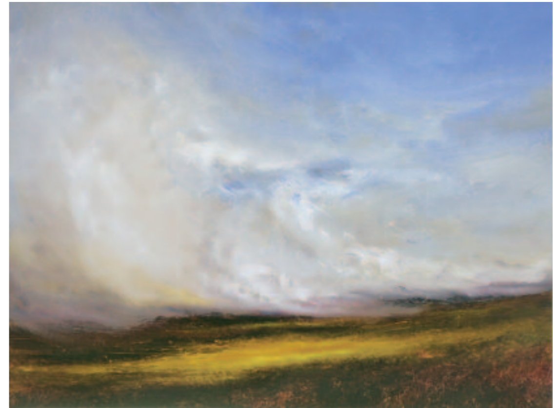
Summer Clouds (Argyllshire) , 2006, oil on canvas 3 x 4 ft (91 x 122 cm)