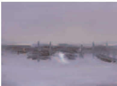
Evening Light (Thames at Battersea) 1-6, 2005, oil on board, 5 x 7 in (13 x 18 cm)