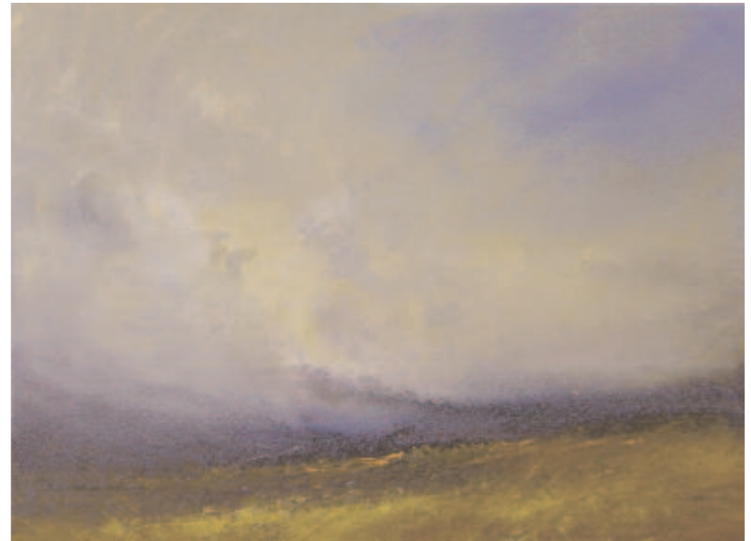
Light on the Mountains , 2006, oil on linen, 18 x 24 in (46 x 61 cm)