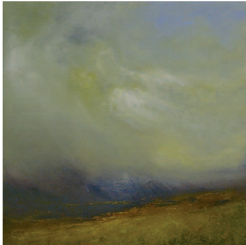
Mountain Rain (Hebrides) , 2006, oil on canvas, 2 x 2 ft (61 x 61 cm)