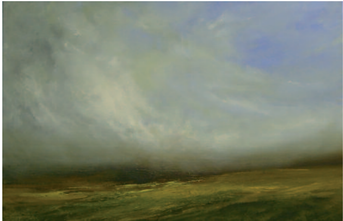
Sun on Rannoch Moor , 2006, oil on linen 24 x 37 in (62 cm x 93 cm)