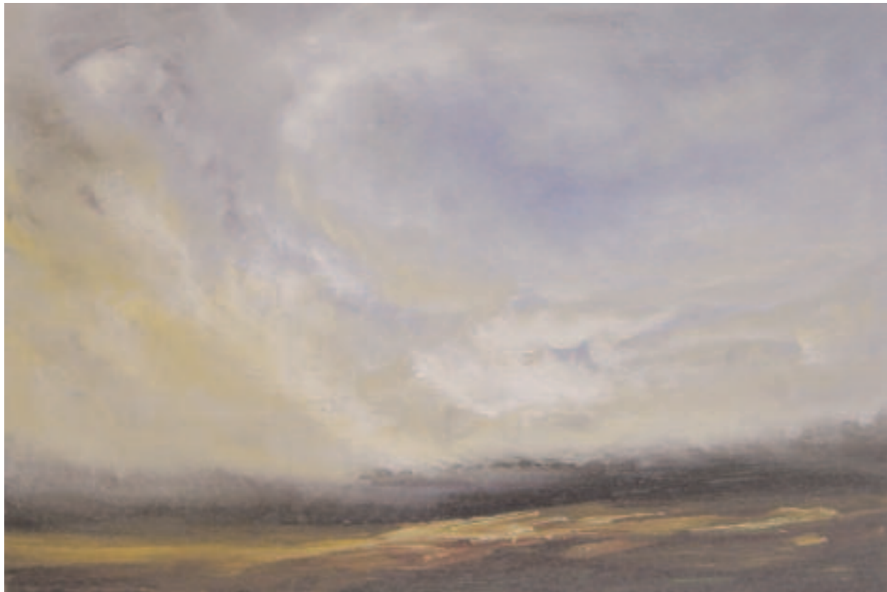
Autumn Moor (Hebrides) , 2006, oil on linen, 4 x 6 ft (122 x 183 cm)