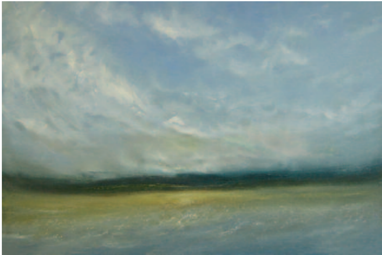
Golden Sands (Hebrides) , 2006, oil on linen, 4 x 6 ft (122 x 183 cm)